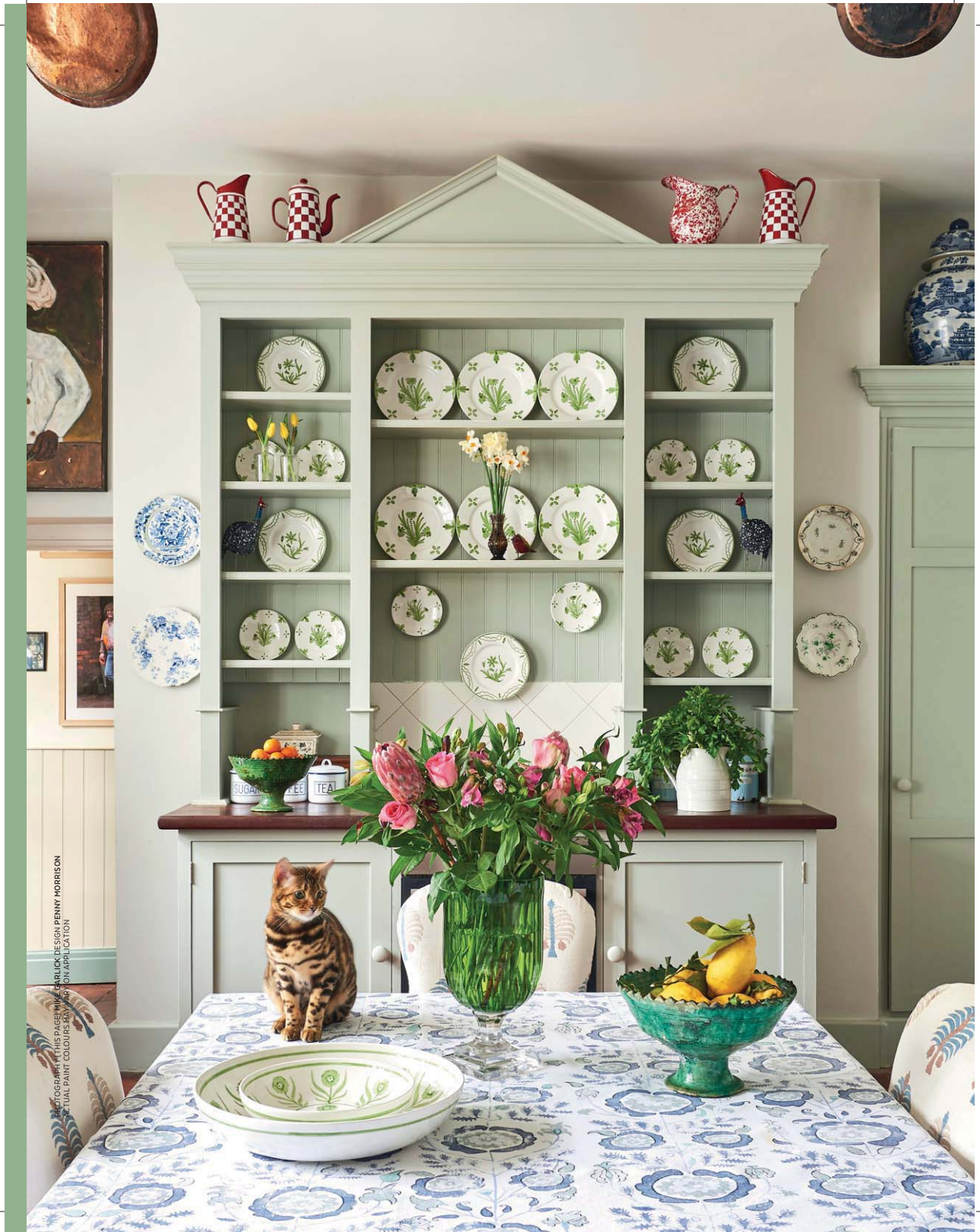
DESIGN PENNY MORRISON ACTUAL PAINT COLOURS MAY VARY ON APPLICATION