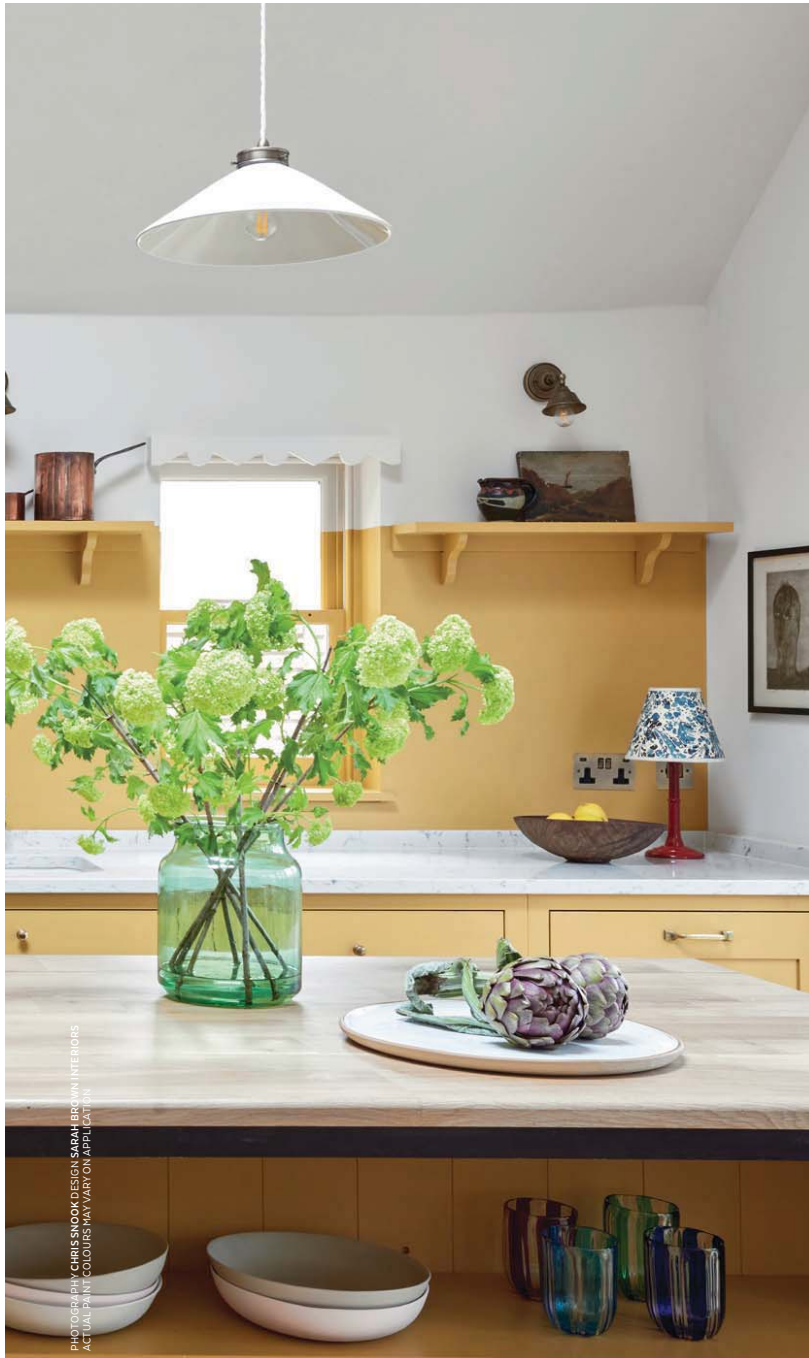
DESIGN; SARAH BROWN INTERIORS ACTUAL PAINT: CASPER WHITE QUARTER, WASH & WEAR SUNDAZE